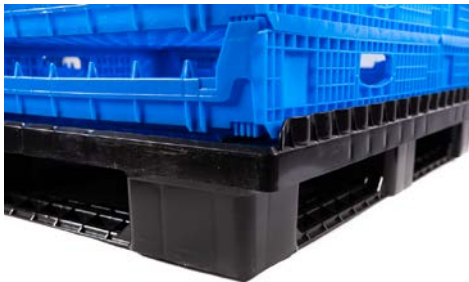
Reinforced guide rails